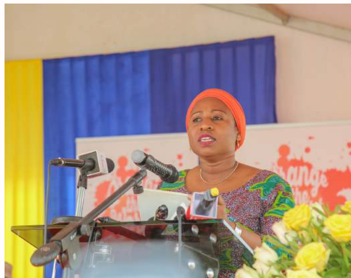
The Guest of Honor: Hon. Ummu Mwalimu, addressing the crowd during the Launching of 16 Days of Activism.

National Bureau of Statistics shall produce and provide data on GBV at the level of district councils. "Let's move from regions and now go to the district to get data that will guide us on where to strengthen our interventions".