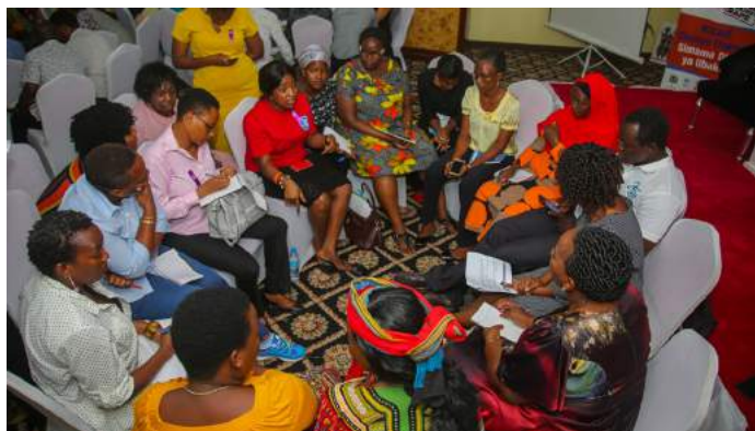
Participants as they initiate the discussion for the annual reflection meeting.

The annual reflection event brought together government officers and civil society organizations (CSO), who are implementing the National Plan of Action to end Violence Against Women and Children (NPA-VAWC).