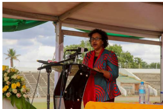
Ms. Hodan Addou, UN Women Tanzania Country Representative, address the crowd at the launching of the 16 Days of Activism Campaign.

Ms. Hodan commended the government of Tanzania for continued commitment to adhering to the global initiatives on the promotion of women's and girls' rights such as the Beijing Platform for Action, Convention for Eliminating all forms of violence against Women (CEDAW), Convention on the Rights of Children. The commitment is demonstrated in-country programs pushing for an end to GBV in particular recent efforts to make gender-responsive budgeting a reality for the effective implementation of NPA-VAWC. Also, she delivered the following messages;