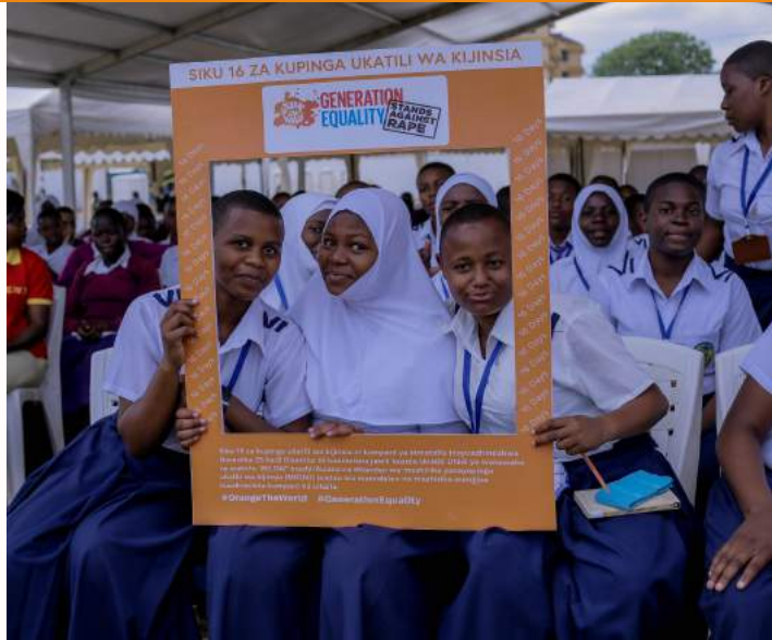
Student participants holding up a frame that spreads awareness about generation equality