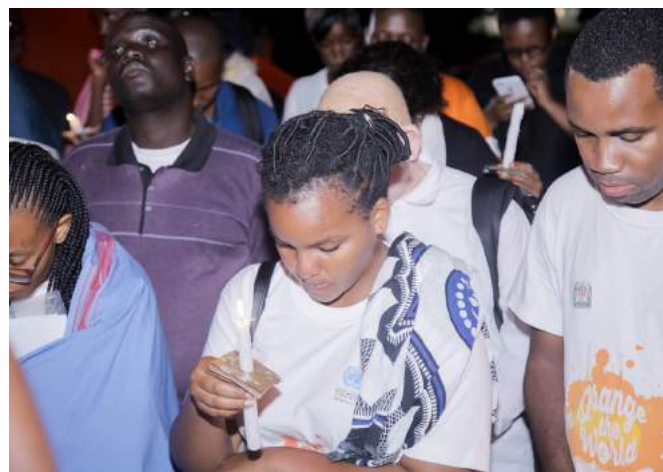
Participants of the vigil as they bow their head in remembrance of women who have been lost to violence.