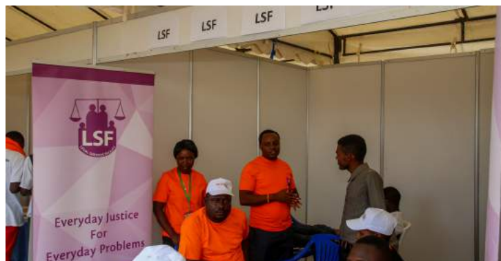
Pictures showing exhibitors providing services to the participants.

Institutions and organization participated also showcased their works on ending GBV and supporting victims. Police gender and children desk showcased handling of GBV cases at one-stop centre from reporting, supportive health services, investigation, evidence collection to prosecution in a Court of Law. MoHCDGEC brought and disseminated guidelines, directives and other publications made relating to GBV, women empowerment and children welfare.