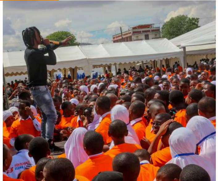
Performance from Artist Barnaba Boy inspire younger generation

Over 5000 participants, representatives from the Government officials, international communities, National and International humanitarian agencies working on GBV prevention and response, Civil Society Organizations, GBV MKUKI Coalition, students from local secondary schools and universities, participated in the launching day.