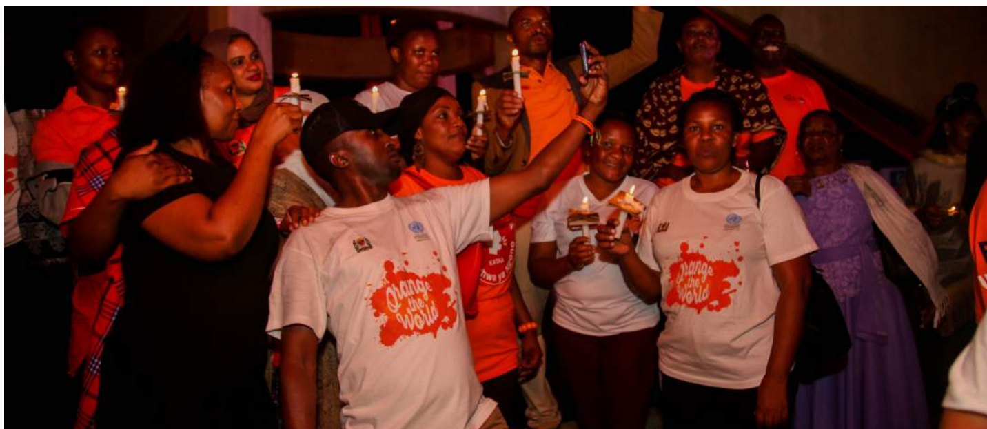
Some of GBV mkuki coalition members taking a picture at Jamatini ground during the candle light event.