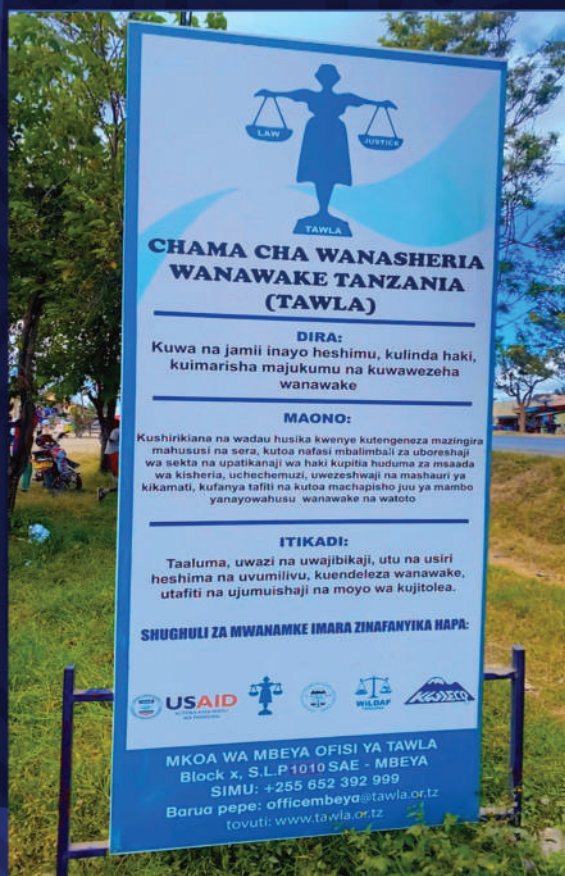
An office signage for Mwanamke Imara Legal Aid Clinic in Mbeya-Sae.