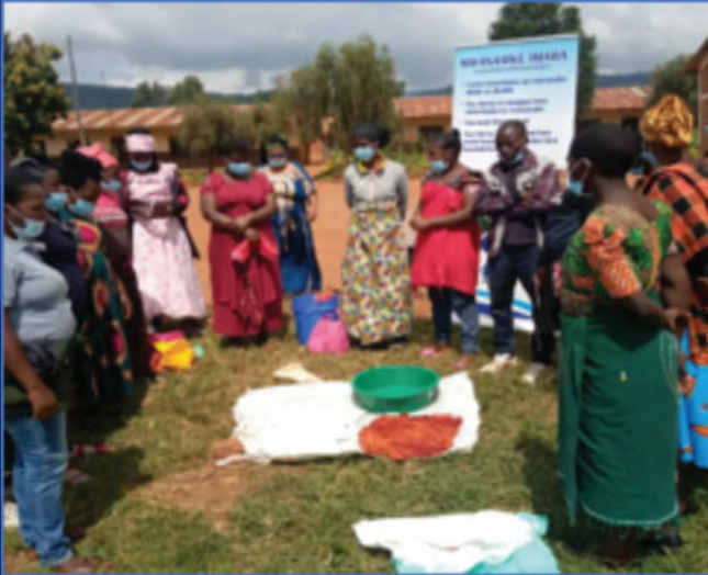
Soap making in Ludewa district