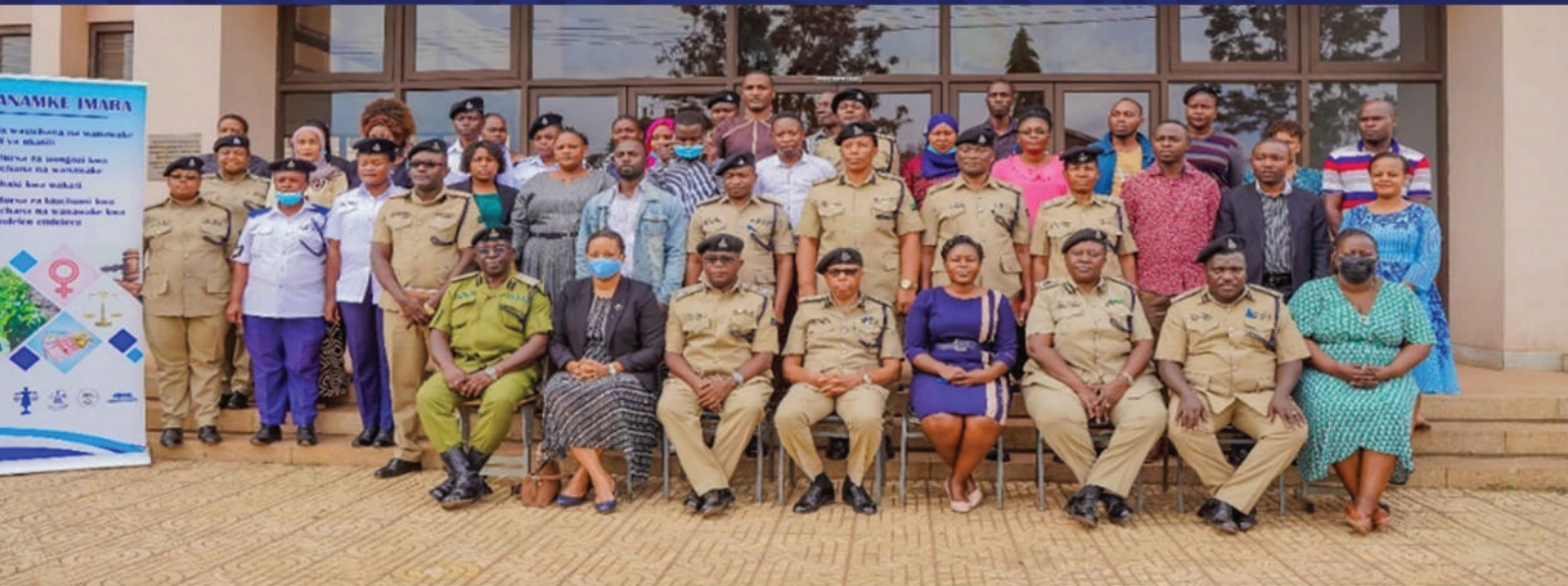
Members of Police Gender and Children Desks and Mwanamke Imara Implementing Partners during the Training that took place at Kilimanjaro