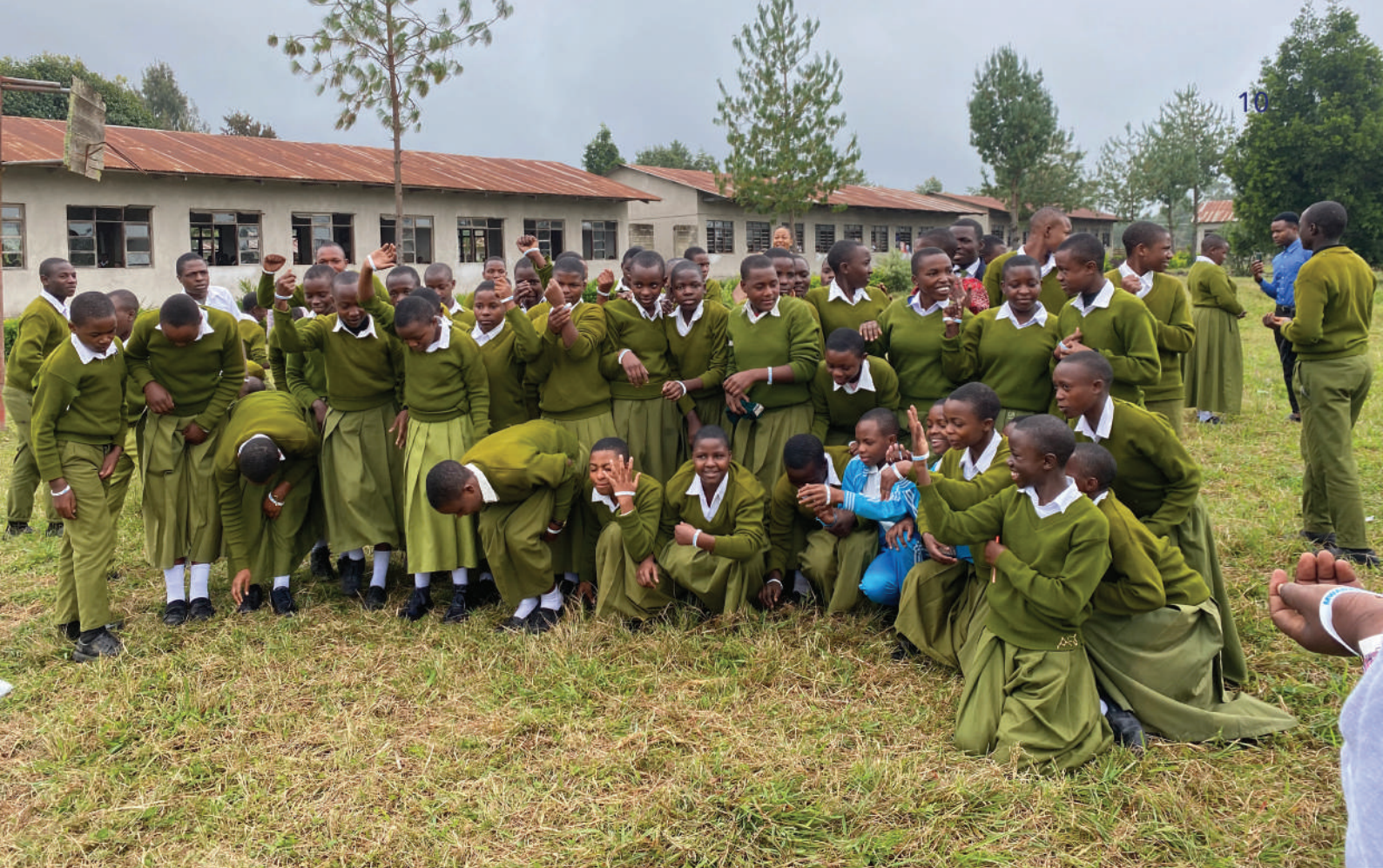
A group picture of members of the Mwanamke Imara Shule Salama Club at Kiwira Secondary School.