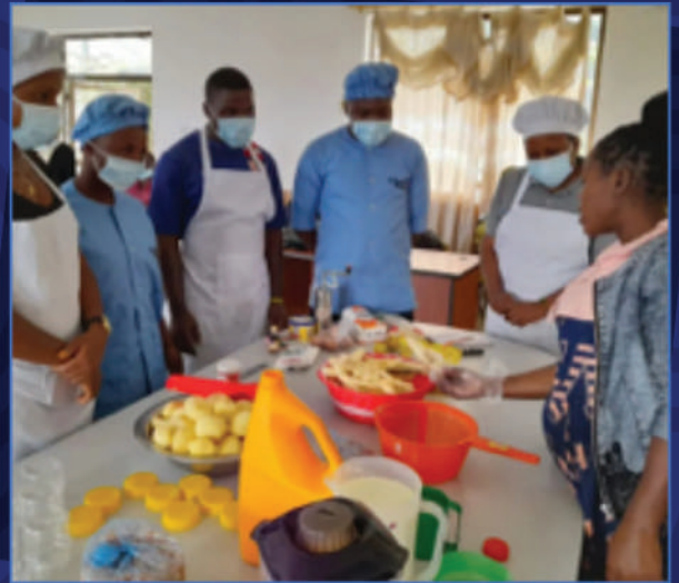
Snacks making in Rungwe district