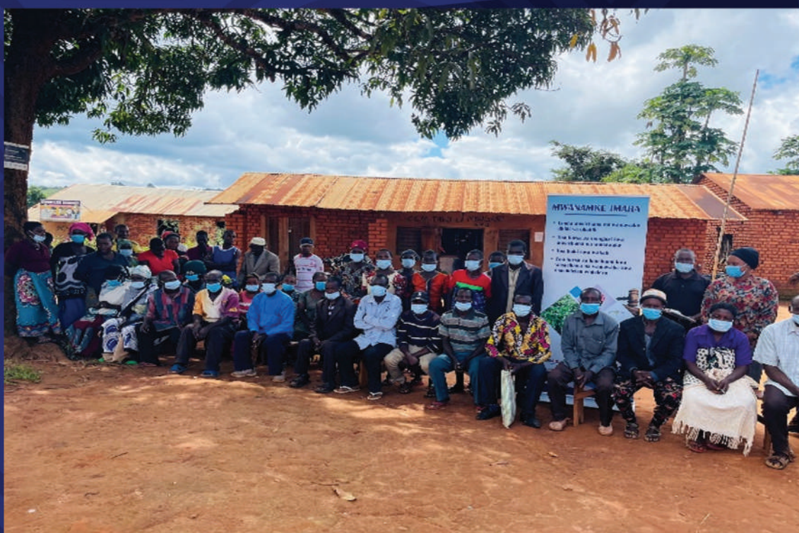
Community members during community awareness session on gender and leadership role to change community perception on women and youth leaders at Mbugani village in Ludewa District