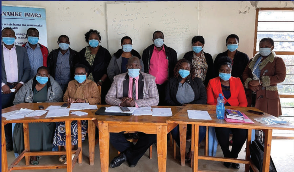
A group photo of members of VAWC Committee at Makete District during one of their quarterly meetings.