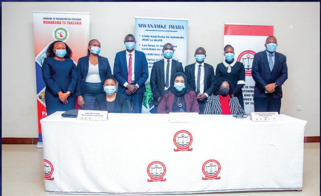
Judge in Charge of the High Court of Tanzania Tanga, Hon. Latifa Mansour (seated in the middle) with Magistrates during a training conducted at Institute of Judicial Administration (IJA), Lushoto Tanga tanga