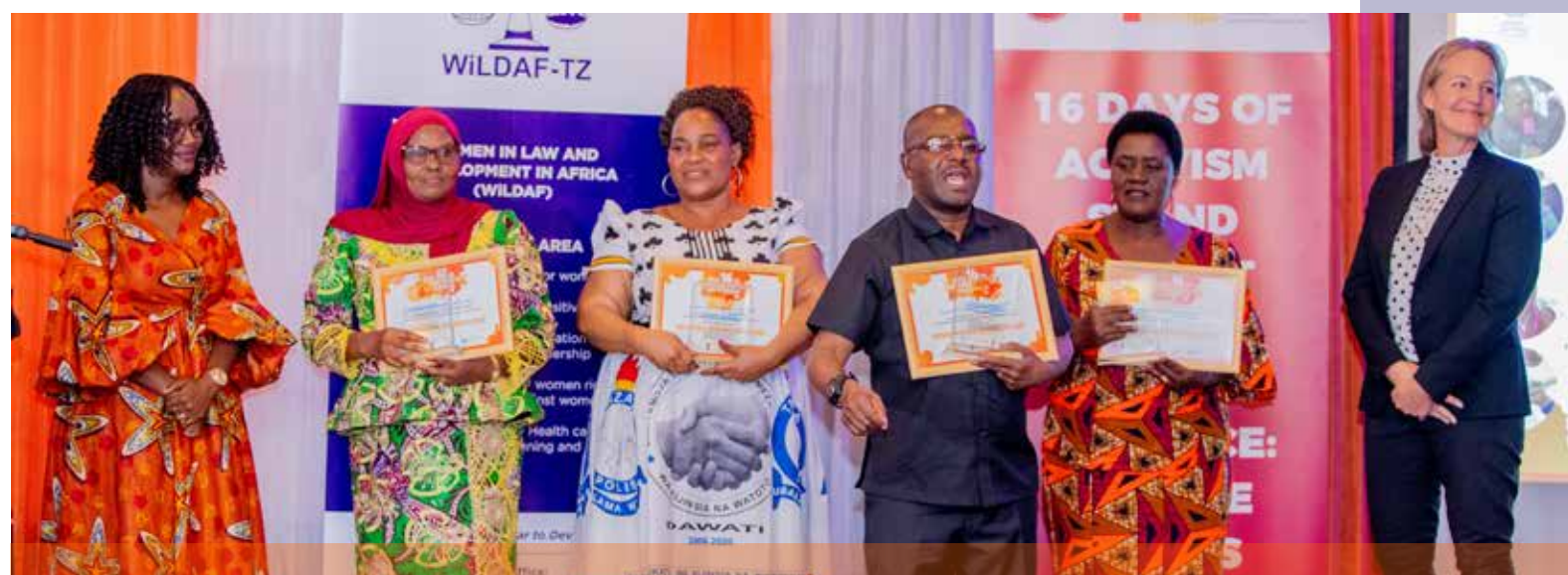
Some of the anti-GBV champions receiving awards in recognition of their extraordinary efforts to end GBV in their communities