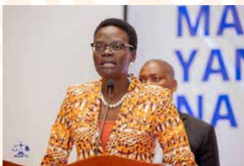
Picture No 2. Hon. Tulia Ackson, the Guest of Honor, delivering key note address

The Guest of Honor, the URT Deputy Speaker, Hon. Dr. Tulia Ackson asked GBV MKUKI Coalition to share GBV data which will help members of parliament to have evidence data. In addition she inquired on the deliberations made in the course of commemorating the campaign in order for the parliament to implement. GBV Taarifa App, an innovative software aiming at increasing accessibility to support services amongst GBV survivors was launched during the inauguration day. The application is accessible on Android and IOS platforms providing emergency response as well as resource information on GBV prevention and response (picha ya GBV Taarifa App)