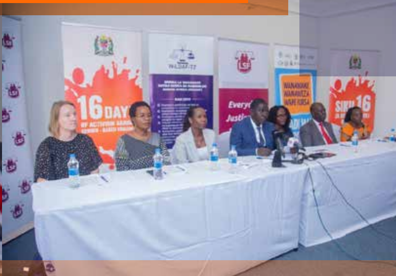
Representatives from the MoHCDGEC, Development Partners and GBV MKUKI Coalition members during the press conference towards launching of the campaign