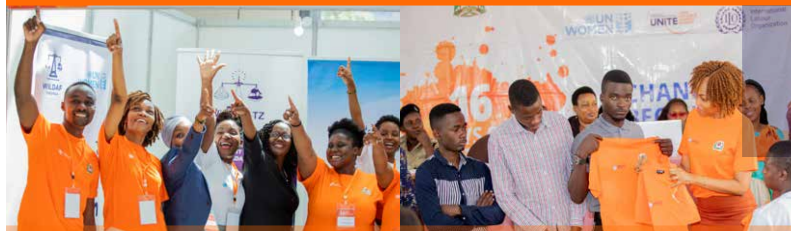
Jovial WILDAF staff during the National launching of 16 days of activism campaign