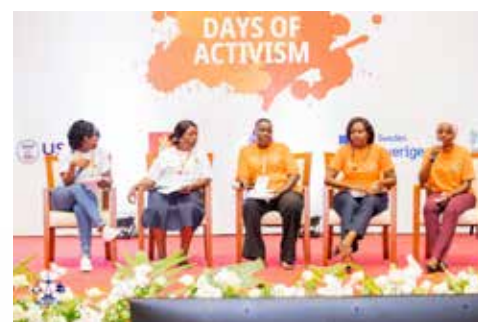
Picture No 3. Panelists during the launching of 16 days of activism campaign against gender based violence

To cast an anchor on the 16-day activism against GBV, the campaign encouraged male participation. Since GBV will not be eradicated without the participation of all community members and the involvement of traditional and religious leaders as agents of change in their communities we hope that the actions will contribute to transparency beyond the government to include the judiciary, the political parties, higher education institutions, employers, and the general society, encouraging all Tanzanians, boys and girls, men and women, to be active participants in ending gender-based violence.