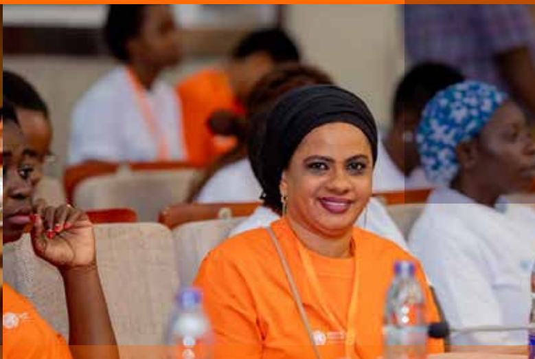
The participants of the National Launching event of 16 days of activism, The event was held at Mwl Julius Nyerere International Conference Center Dar es Salaam on 25th of November 2020.