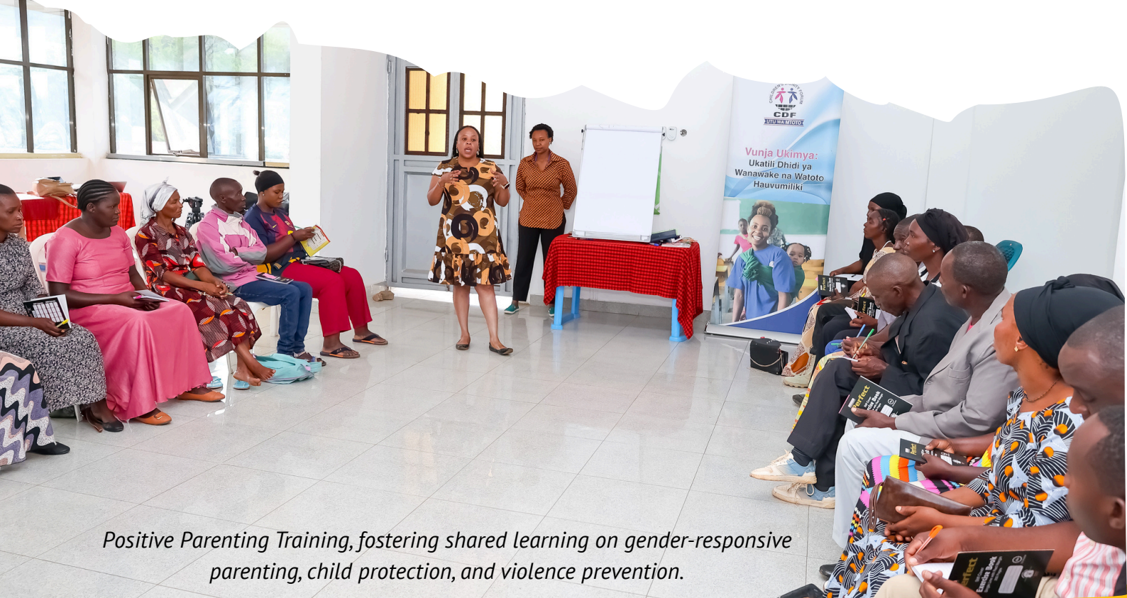
Positive Parenting Training, fostering shared learning on gender-responsive parenting, child protection, and violence prevention.